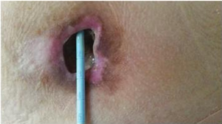
Above picture taken 17/12/15, right hip