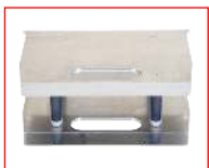
Toe plate for the transportation of laundry