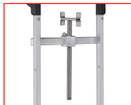
Hook for crates