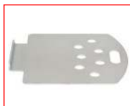
Toe plate to hook on