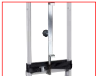
Holding device for grocery boxes