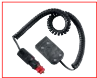
Charger for your car