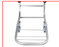
Foot rest 5 or 10 cm