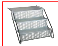
Stairs made of steel