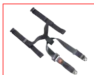
Seat belt system including hip belt